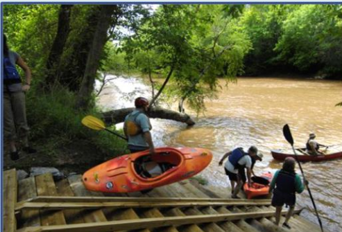
Sample of Canoe and Kayak Launch Area