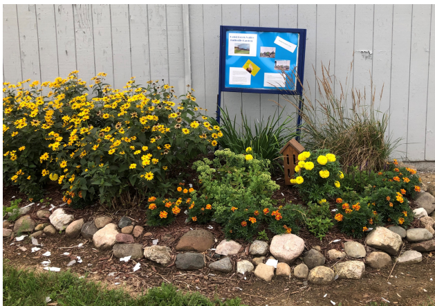
Paint Creek 4H volunteers with native seedballs Pollinator garden at the Oakland County Fairgrounds