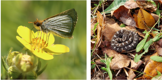
Poweshiek skipperling & massauga rattlesnake