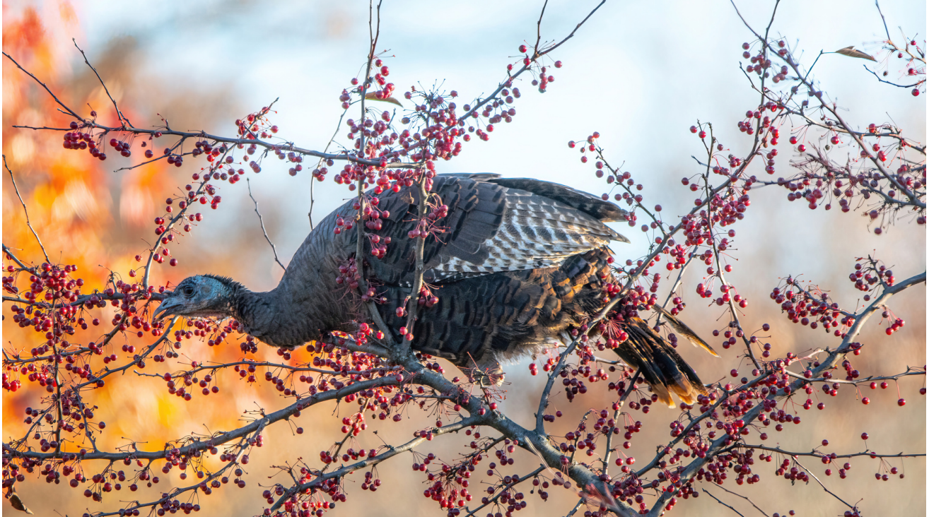
Turkey