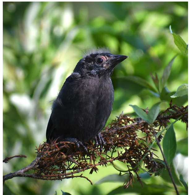
Baby red-winged blackbird