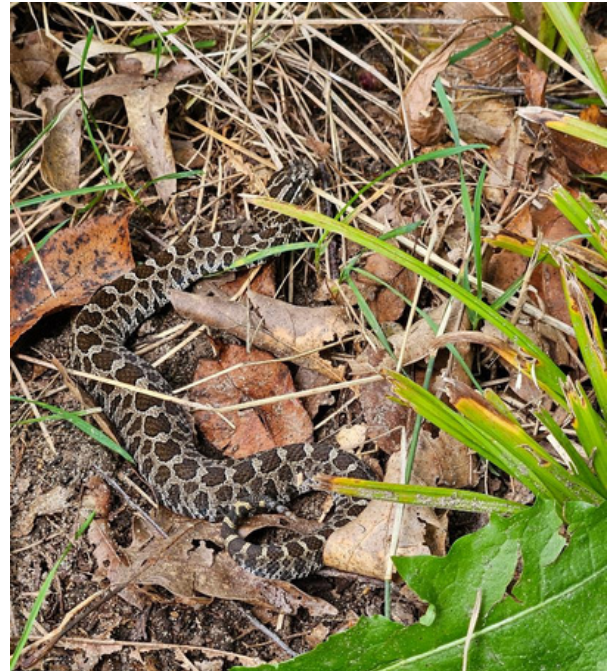
A tour of one of our properties revealed a state threatened Massasagua Rattlesnake